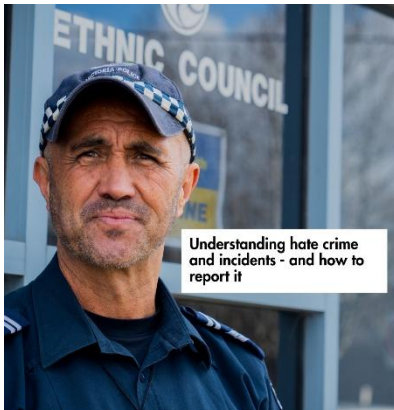
Understanding hate crime and incidents - and how to report it