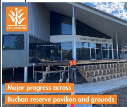
Major progress across

Great to see it all coming together. Thanks to the Buchan community for your patience – more updates soon as we get closer to completion.