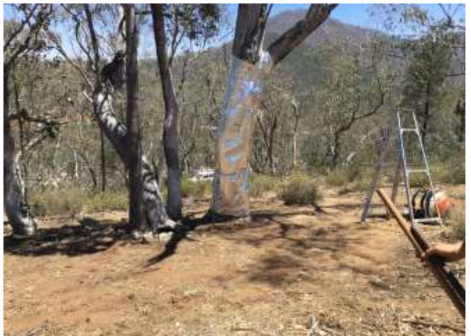
A scar tree wrapped in sisalation

This method proved to be extremely successful at protecting the scar trees from being directly impacted by fire and lost.