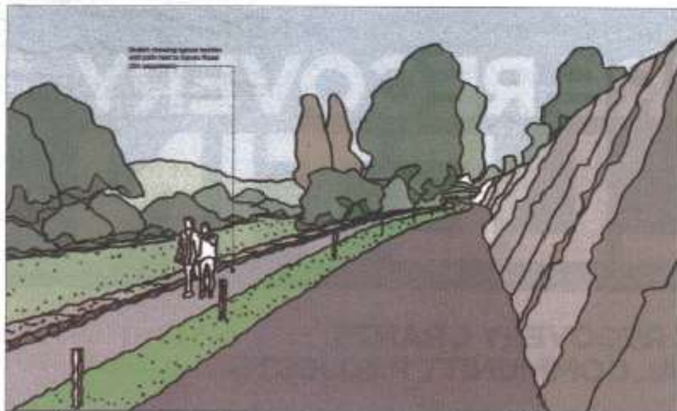
An artist's impression of the linkage path between Buchan Caves campground and the Main Street.