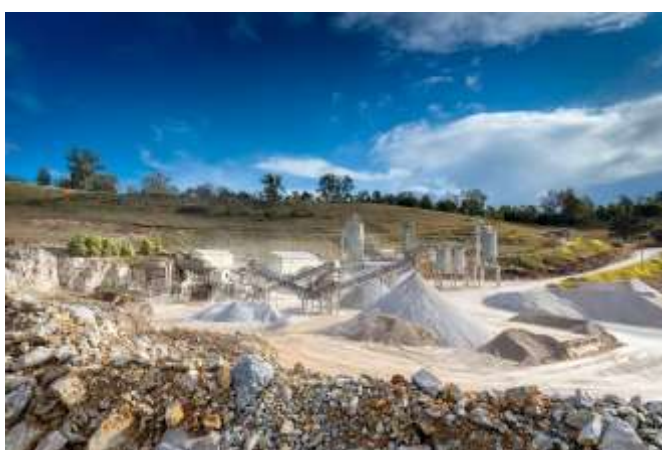
Sibelco Lime mining Buchan